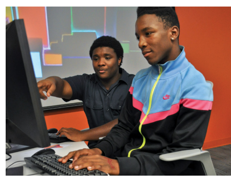
NewBridge Cleveland Center for Arts and Technology offers youth programs and adult workforce training, funded by the city's multi-anchor Greater University Circle Initiative.

Someone has to coordinate these elements into a cohesive initiative. Large anchors have a great deal of in-house planning skill and regularly engage in long-term planning for their enterprises. When they decide to take on a strategy, anchors can utilize this skill to determine the best ways to engage with the community and local and regional stakeholders. In addition, working through the anchors' strategic planning processes is a way to institutionalize the anchor strategy so that it outlasts the term of a president or CEO and becomes the normal way of doing business.